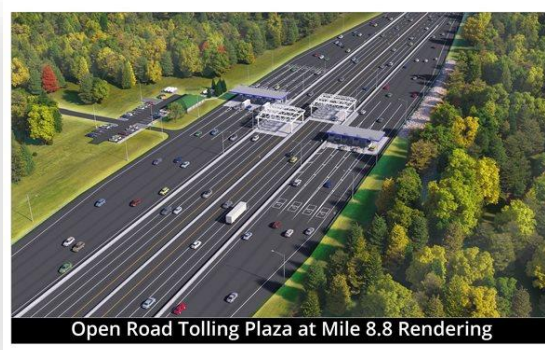
Open Road Tolling Plaza at Mile 8.8 Rendering

In 2016, the Maine Turnpike Authority applied for permits to build a new toll plaza in York at mile 8.8. The US Army Corps of Engineers and the Maine Department of Environmental Protection require applications. It is anticipated that the permits will be received in 2017. The MTA's consultant, Jacobs Engineering researched and produced three reports regarding the relocation of the York Toll Plaza pertaining to Air, Noise and Highway Lighting.