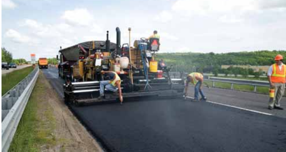
A paving crew near Mile 82. The Turnpike Authority resurfaced 33 lane miles of the highway in 2008.

Pavement rehabilitation is a priority of the Maine Turnpike Authority's 20-year capital plan. Like a roof on a house, pavement serves to protect the valuable highway substructure beneath the roadway surface. Studies show that proper and timely pavement maintenance can result in major cost savings and significantly extend the life of the highway. On average, the Maine Turnpike Authority repaves all sections