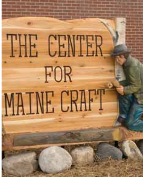
The Center for Maine Craft, at the new West Gardiner plaza, will market Maine creativity to thousands of travelers annually.

Langford and Low of Portland, Maine, was the general contractor for the plaza buildings. Pike Industries/Bridgecorp of Lewiston, Maine, installed water and sewer lines and R.J. Grondin & Sons of Gorham conducted the environmental mitigation project. The total cost of the plaza, completed on time and on budget, was $11.5 million, with the Maine Turnpike contributing $6.7 million and MaineDOT $4.8 million. More than one million travelers are expected to visit the West Gardiner Plaza in 2009.