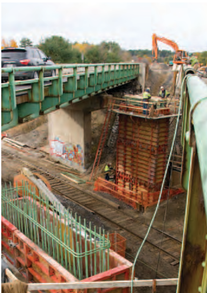
New piers will support a wider bridge over the Maine Central Railroad in Falmouth.

Technical Construction of Turner, Maine, has been on the site of a major $4.4 million two-bridge rehabilitation project on the Falmouth Spur. Construction began on the bridges, originally built in 1955, in June 2009. Reconstruction requires substantial repair to the concrete bridge abutments and bridge decks. Each bridge deck will be stripped down to the bare metal bridge beams, the concrete decks will be replaced and new concrete parapets installed. To improve safety, crews also will add a 10-foot shoulder supported by two new piers to the Maine Central Railroad bridge. Work on the bridges is due to be complete in late 2010.