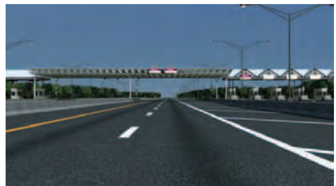
With open road tolling, E-ZPass customers will pay tolls at normal highway speeds by passing beneath a canopy with sensors (photo simulation).

Once approved by the Authority, the findings of the Phase 1 Report will be submitted to the U.S. Army Corps of Engineers (USACE) for review. If the USACE concurs with the findings and recommendations of the study, the Authority and the GEC will launch Phase 2 of the study, a more intensive investigation of the four options with the goal of identifying a preferred alternative. The preferred alternative again will be submitted to the USACE for review. The USACE will then name what it has determined to be the Least Environmentally Damaging Practicable Alternative (LEDPA). Only the LEDPA may be submitted for environmental permitting. The Authority anticipates completing the environmental permitting process in 2011, beginning construction in 2012 and opening the new plaza in 2014.