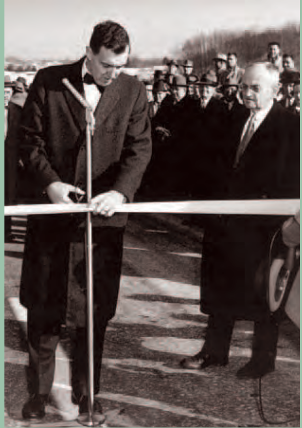
Maine Governor Edmund S. Muskie cuts the ribbon opening the Portland-to-Augusta extension in 1955.

A seven-person board, appointed by Maine's governor and confirmed by the Maine Senate, governs the Maine Turnpike Authority. This board oversees maintenance, construction, operation, finance and management of Maine's most traveled highway.