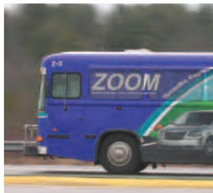
More than 38,000 commuters rode the ZOOM Turnpike Express in 2009.

The Maine Turnpike Authority’s alternative modes programs and traffic demand management program are part of the agency’s commitment to pursuing environmentally friendly policies and services. These programs include operation of park & ride lots and support of carpools, vanpools and transit through co-funding of the GO MAINE commuter assistance program and the ZOOM Turnpike Express with the MaineDOT.