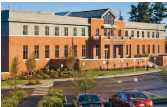
The Turnpike's new administration and public safety building in Portland is LEED-certified.

The building was designed and built to Leadership in Energy and Environmental Design (LEED) specifications by SMRT Architects and Wright Ryan Construction, both of Portland, Maine. It is only the 41st building in the state of Maine to achieve LEED certification.