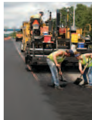
Paving along one of the Turnpike's busiest sections.

Pavement rehabilitation is a priority of the Maine Turnpike Authority's 20-year business and capital improvement plan. Like a roof on a house, pavement serves to protect the valuable highway substructure beneath the roadway surface. Studies show that proper and timely pavement maintenance can result in major cost savings and significantly extend the life of the highway. On average, the Maine Turnpike Authority repaves all sections of the highway every 12 to 15 years.