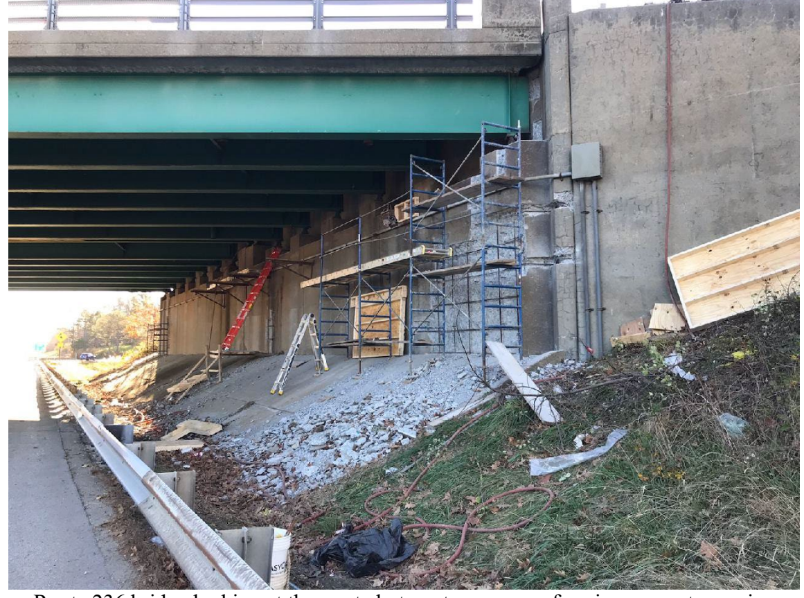
Route 236 bridge looking at the west abutment: crews performing concrete repairs.

Contractor: New England Infrastructure, Inc. Bid Amount: $2,579,980.00